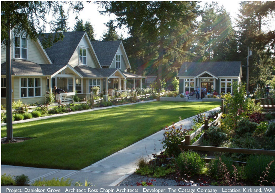
Project: Danielson Grove Architect: Ross Chapin Architects Developer: The Cottage Company Location: Kirkland, WA

Adopt proposed Section 509 (“Cottage Developments”) and amend the R-1, R-2, R-3, R-O, and R-O-1 district tables to allow Cottage Developments by Conditional Use Permit. The purpose of this new section is to provide opportunities for single family housing that is smaller, more energy efficient, and more affordable, while promoting projects that ensure compatibility with surrounding land uses. The amendment allows Cottage Development by Conditional Use Permit from the Planning Board on lots of at least 40,000 sq. ft. in size in the R-2 and R-3 Districts, and at least 20,000 sq. ft. in the R-1, R-O, and R-O-1 Districts, subject to the availability of appropriate utilities. To obtain a Conditional Use Permit, the project must comply with the design standards set forth in proposed Section 509. A Cottage Development will also require Site Plan Review from the Planning Board and compliance with the Lebanon Site Plan Review Regulations. ( Zoning Ordinance Sections 205, 308.2, 309.2, 310.2, 311, 311A, 500, new 509, and Appendix A )